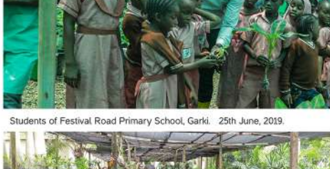
Students of Festival Road Primary School, Garki. 25th June, 2019.