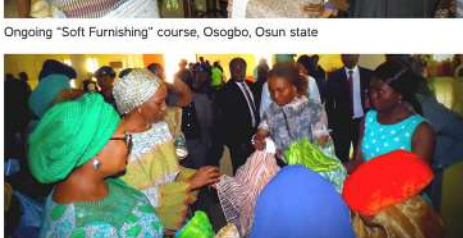
The Transit Home skill acquisition training.

Services rendered at the shelter include: rehabilitation, medical, psycho-social counselling, vocational training and of course, feeding and accommodation. TWHHI shelter services are free for all residents.