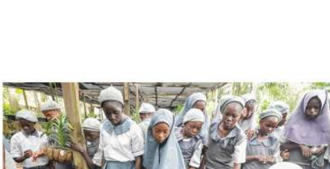
Students of Junior Secondary School, Karu. 26th June, 2019.