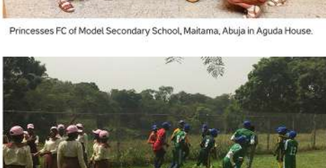
Princesses FC of Model Secondary School, Maitama, Abuja in Aguda House.

The football club visited His Excellency, Vice President FRN, Prof. Yemi Osinbajo and Her Excellency, Mrs. Dolapo Osinbajo in Aguda House, Abuja. So much fun running around in the garden, a real treat to meet the Vice President in Aso Rock!