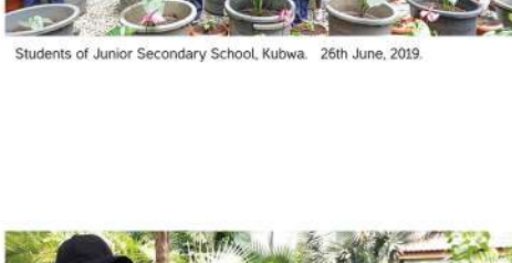
Students of Junior Secondary School, Kubwa. 26th June, 2019.