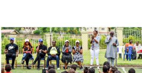
Princesses FC of Model Secondary School, Maitama, Abuja in Aguda House.