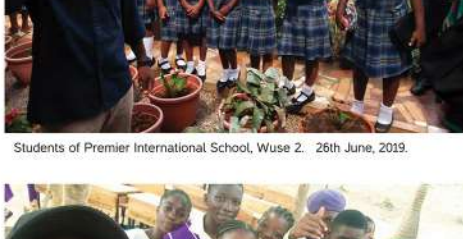
Students of Premier International School, Wuse 2. 28th June, 2019.