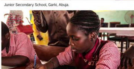
School for the Deaf, Abuja.