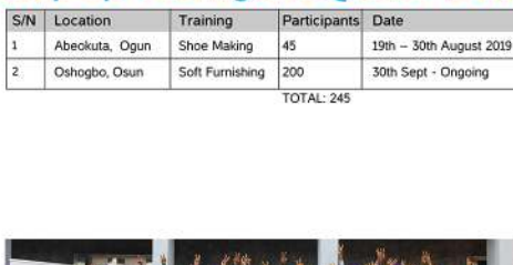
The Harbour residents in the skill acquisition training room.