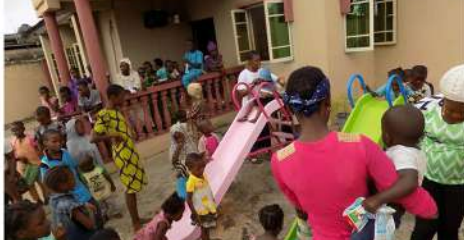
Mararaba Bookshelf Centre, Nasarawa State.

August is the Bookshelf "Book Reading Month". This focus is given at this time when children are on holiday with more time on their hands. Reading "a book a day" helps to expose the children to a wide variety of books in a short time, though they may be unable to finish each book, it creates a thirst for more. The different Bookshelf centres have a variety of programs for the children particularly at this time as well as throughout the year. TWHHI has set up "The Bookshelf" in 10 locations in Nigeria.