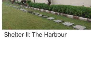
Shelter I: The Transit Home