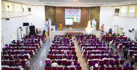
Shoe making graduation, Abeokuta. 30th of August, 2019.