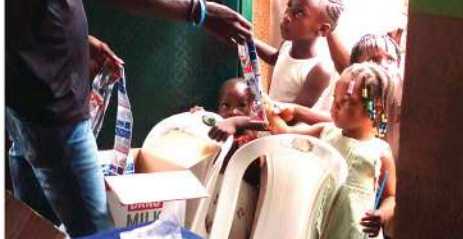
Residents from The National Agency for the Prohibition of Trafficking in Persons (NAPTIP) home join one of The Bookshelf meetings in Aguda House, Abuja.