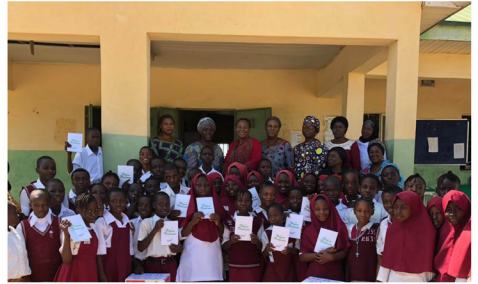
Junior Secondary School, Kuje. 4th of November, 2019.