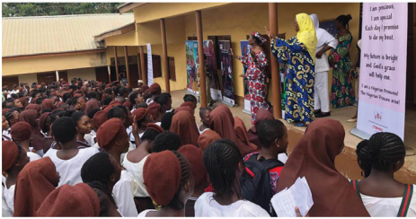
Government Day Secondary School, Wuse 2. 12th of November, 2019.