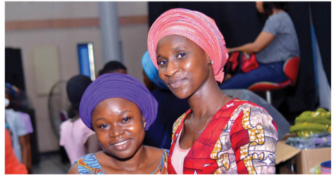
Training, Party Support Services.