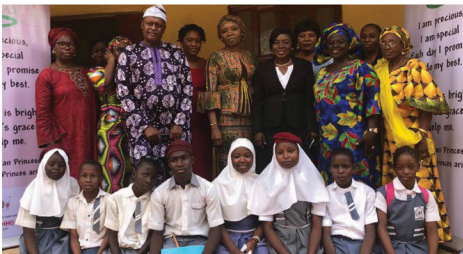
Junior Secondary School, Apo Legislative Qtrs. 29th of October, 2019.

Step Up is a mobile skill acquisition program for women but not excluding men. Courses taught include basic sewing, soft furnishing, bag making, beadwork on fabrics, make up and gele tying and shoe making. Training is free and mobile; Step Up moves from one location to another nationwide. 728 students were trained between October - December, 2019.