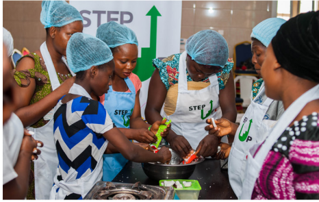
Party Support Services training, Ikorodu.