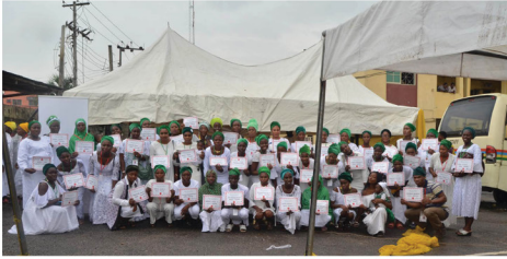
Kosofe basic sewing graduation, (Set 2), 18th of October, 2019.