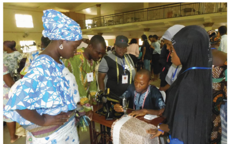
Soft furnishing participants, Osogbo, Osun.