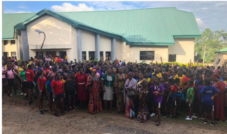
Anglican Girls Grammar School, Apo. October 29th, 2019.