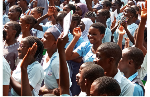
Junior Secondary School, Wuse Zone 6. 6th of November, 2019.