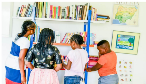
The Bookshelf, Aguda House, Abuja.

Our bookshelves are equipped with books and other accessories placed in different communities with the aim of encouraging and nurturing a reading culture in children.