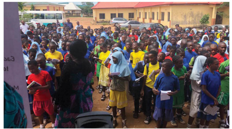
Junior Secondary School, Bwari, 30th of October, 2019.