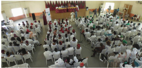
Soft furnishing graduation, Osogbo, Osun State. 11th of October, 2019.