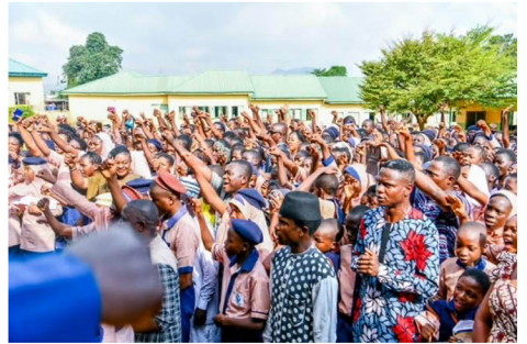
Junior Secondary School, Kubwa 3. 1st of November, 2019.