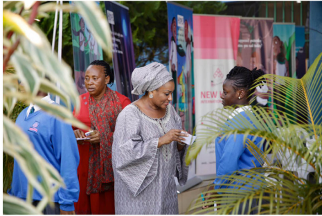
New Hope International School, Kuje, 4th of November, 2019.