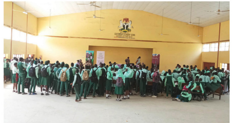
Government Secondary School, Gwarimpa (Life Camp). 15th of November, 2019.