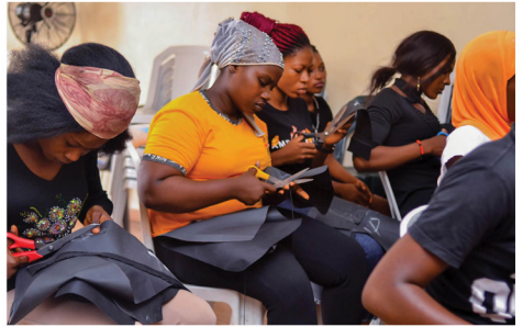
Bag making class, Ikota.