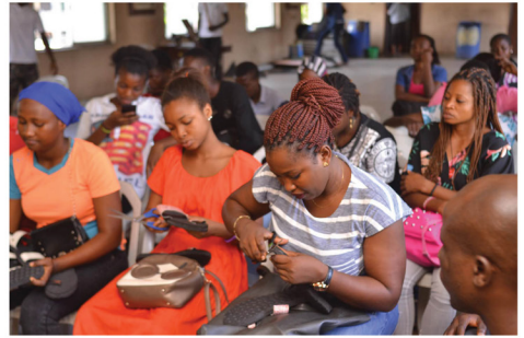
During Shoe Making Training, Yaba.