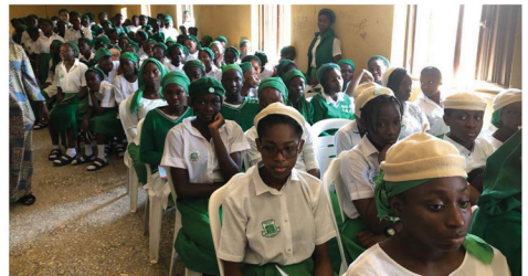
Government Girls Science Secondary School, Kuje, 4th of November, 2019.