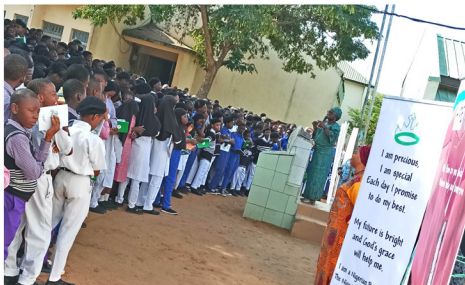
Government Science and Technical College, Garki, 7th of November, 2019.