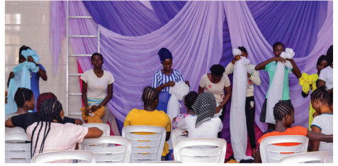
Training, event decoration, Ikorodu.