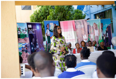
New Hope International School, Kuje, 4th of November, 2019.