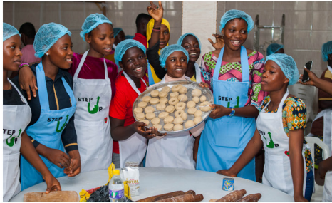
Party Support Services training, Ikorodu.