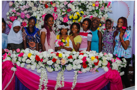
Students showcasing their work during the training.