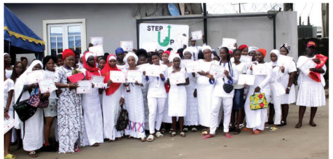
Bag Making Graduation, Ikota. 18th of October 2019.