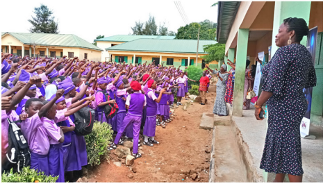
Junior Secondary School, Jabi 1 (Life Camp) 14th of November, 2019.