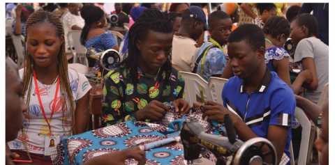
Basic sewing class, Kosofe, Lagos.