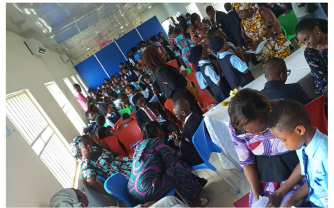
Surestart Academy, Kubwa. 1st of November, 2019.