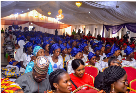
Cross section of participants.