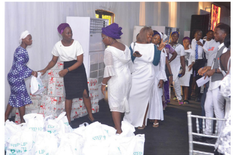
Gifts for each of the 1,142 students that attended the class meeting "Lagos Class of 2019" celebration. Courtesy of TWHHI and Honeywell Flour mills.