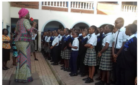
Stella Maris, Garki. 6th of November, 2019.