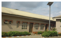
Shelter I: The Transit Home