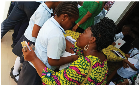
Miniebi International Academy, Gwarimpa. 15th of November, 2019.