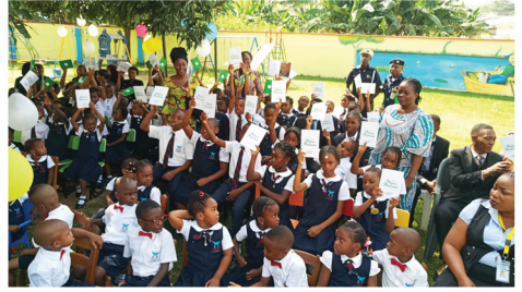
Awesome Kids Academy, Gwarimpa, 15th of November, 2019.