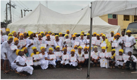
Kosofe basic sewing graduation, (Set 1), 18th of October, 2019 .