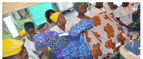
Finished works displayed by participants on their graduation day 18th of October, 2019.