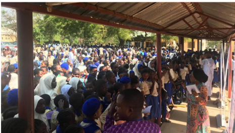
Junior Model Secondary School, Maitama. 5th of November, 2019.