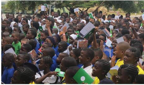
Junior Secondary School, Durumi. 31st of October, 2019.