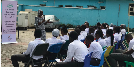
Trailblazers Academy, Gwarimpa. 14th of November, 2019.