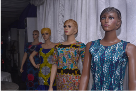
Beadwork on fabrics.