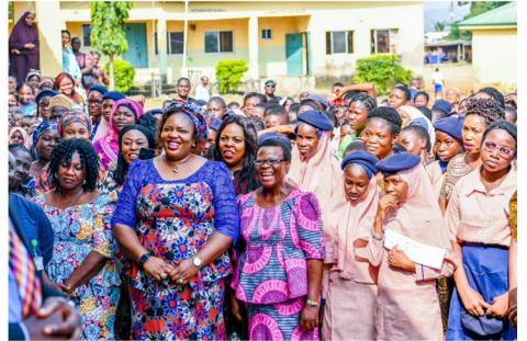
Junior Secondary School, Kubwa 3. 1st of November, 2019.