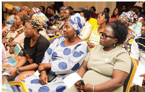
Concerned mothers meeting, Aguda House, Abuja. 10th of October, 2019.