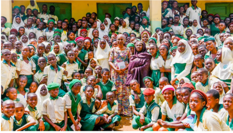
Junior Secondary School, Airport. 28th of October, 2019.