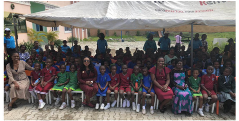
Crystalsgems International School, Ushafa, 30th of October, 2019.