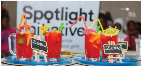
Party Support Services (Cocktail/Mocktail) at Imota, (Ikorodu).