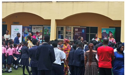
Raberto School, Wuse II. 12th of November, 2019.