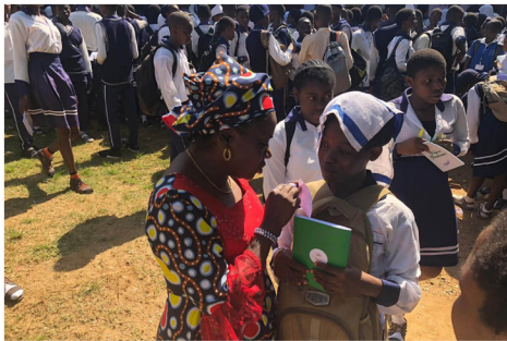
Government Secondary School, Lugbe, 8th of November 2019.