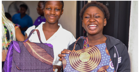
Students displaying their works.