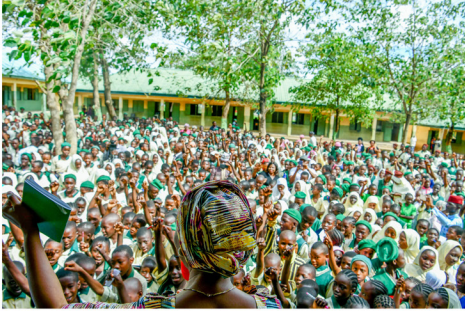
Junior Secondary School, Airport. 28th of October, 2019.