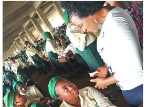
Government Science Secondary School, Pyakasa. 11th of November, 2019.