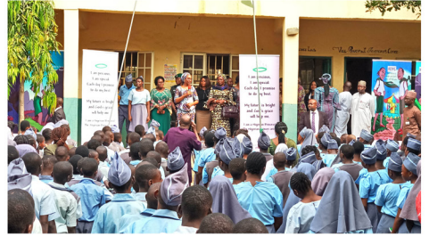
Junior Secondary School, Wuse Zone 6. 6th of November, 2019.