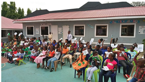
Gigatt International Academy, Gwarimpa. 14th of November, 2019.