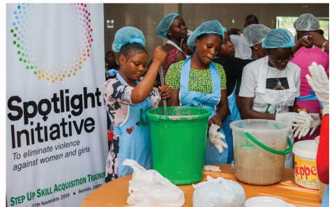
Party Support Services training, Ikorodu.

Step Up organized an empowerment program for out-of-school girls in collaboration with Spotlight Initiative, a UNFPA program targeted at ending violence against women. The "Party Support Services" and "Beadwork on fabrics" were held in Ikorodu and Yaba in Lagos. This provided a training opportunity for the girls along with education on preventing early pregnancy and the importance of planned parenthood.